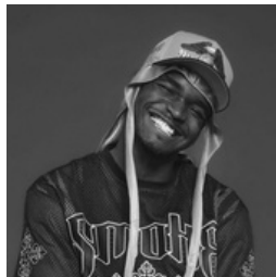
Nas Company Artist